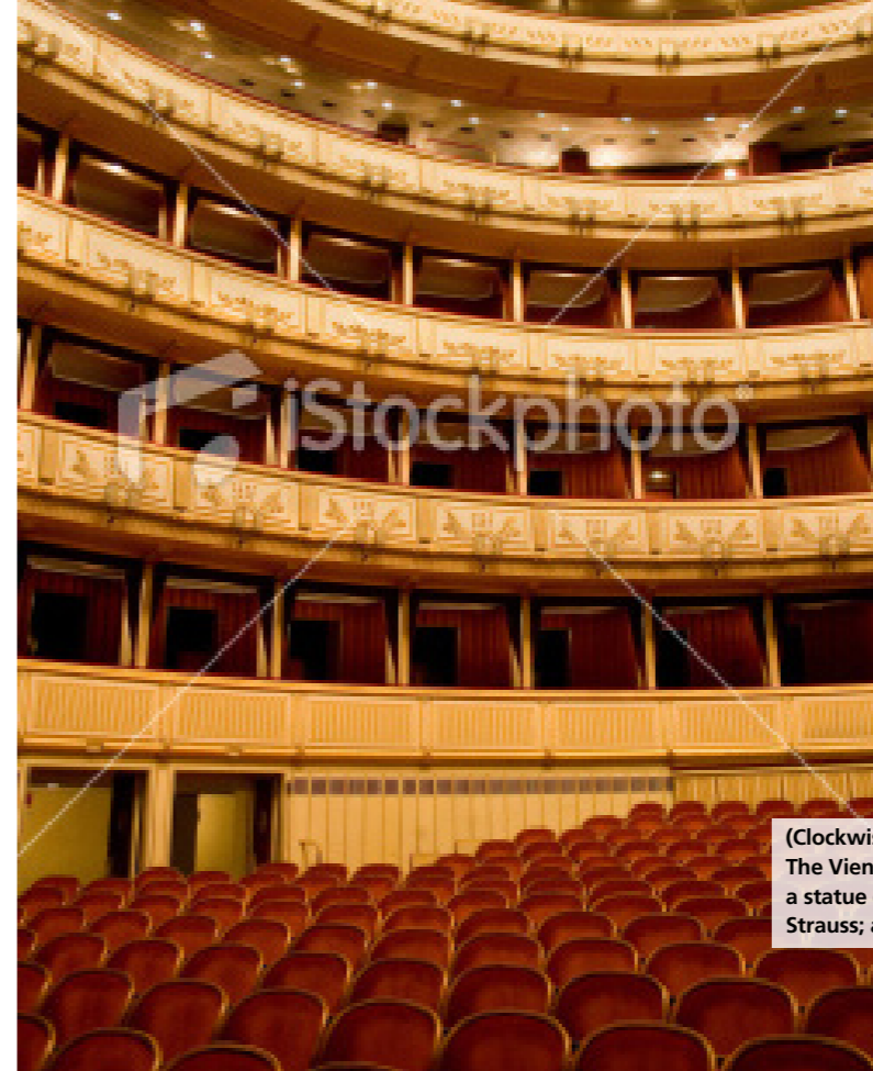
(Clockwise from left) The Vienna State Opera; a statue of Johann Strauss; apple strudel

Vienna is synonymous with the melodic styling of many of the world's most revered composers such as Mozart and Schubert, and it would be a sin to leave the city without revelling in its