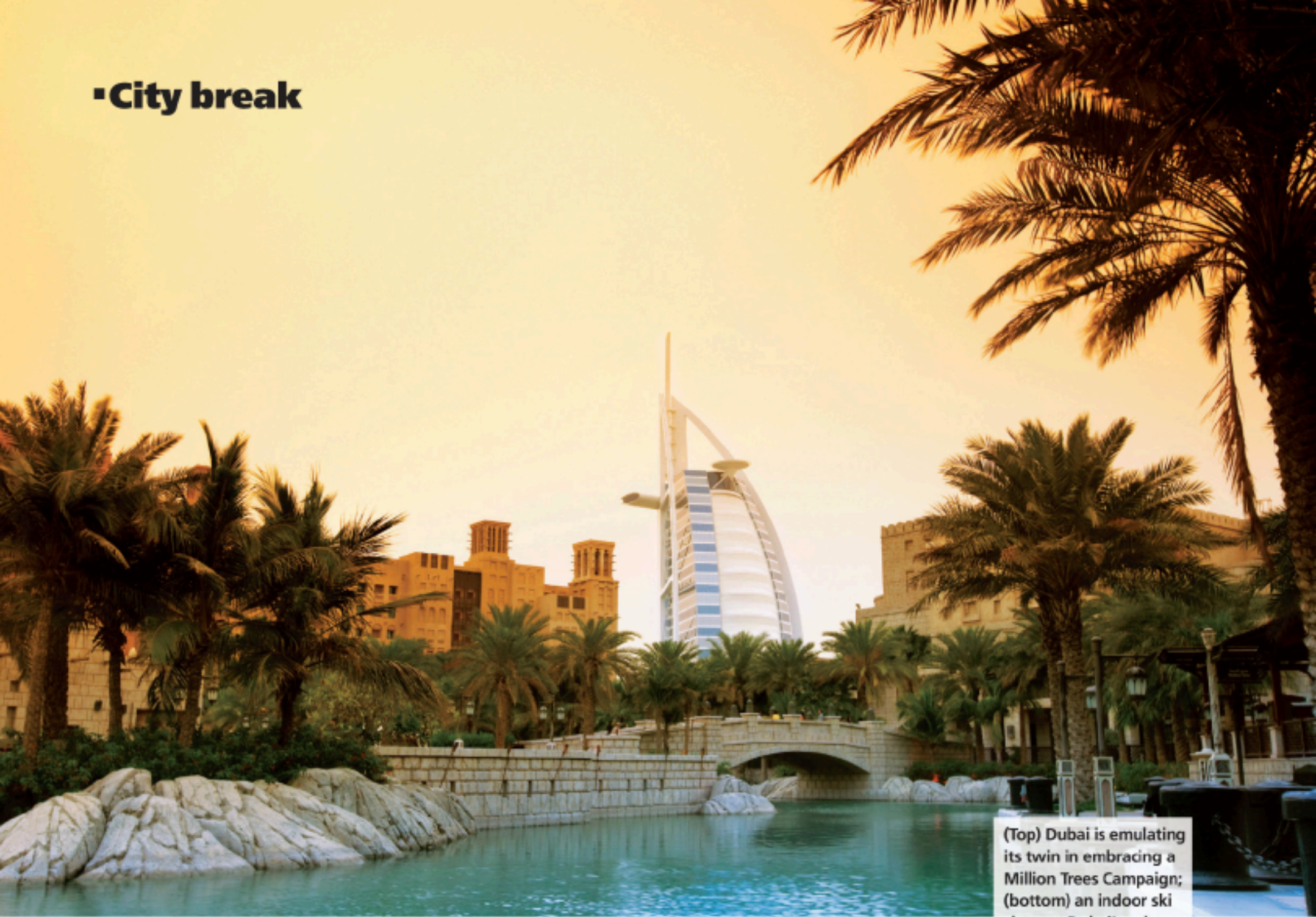
(Top) Dubai is emulating its twin in embracing a Million Trees Campaign; (bottom) an indoor ski slope at DubaiLand

travel initiative which provides green transport solutions throughout the city. And a pleasant surprise awaits as luxury transport is the order of the day. With ecological taxis and low emission vehicles, visitors and locals will be able to choose the green machine of their dreams.