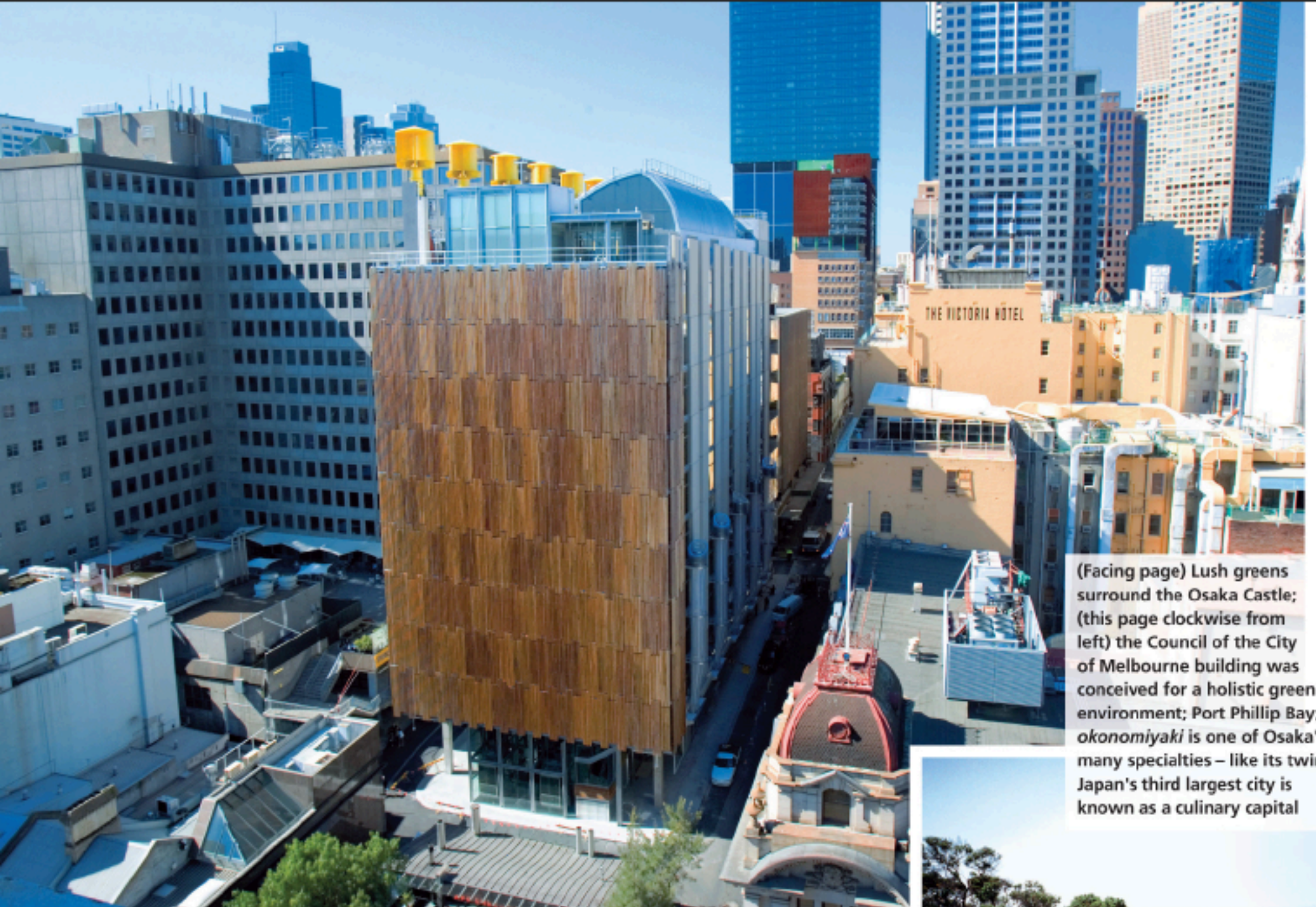
(Facing page) Lush greens surround the Osaka Castle; (this page clockwise from left) the Council of the City of Melbourne building was conceived for a holistic green environment; Port Phillip Bay; okonomiyaki is one of Osaka's many specialties – like its twin, Japan's third largest city is known as a culinary capital

include Nagai Park, Osaka Castle Park, Sankaku Park and Tennoji Park. And there's one more in the making – Osaka Station City , a large retail and office complex connected to one of the city's main stations, is set to receive a green roof that will be home to a farm with vegetable patches and rice paddies. It is due to be completed in spring.