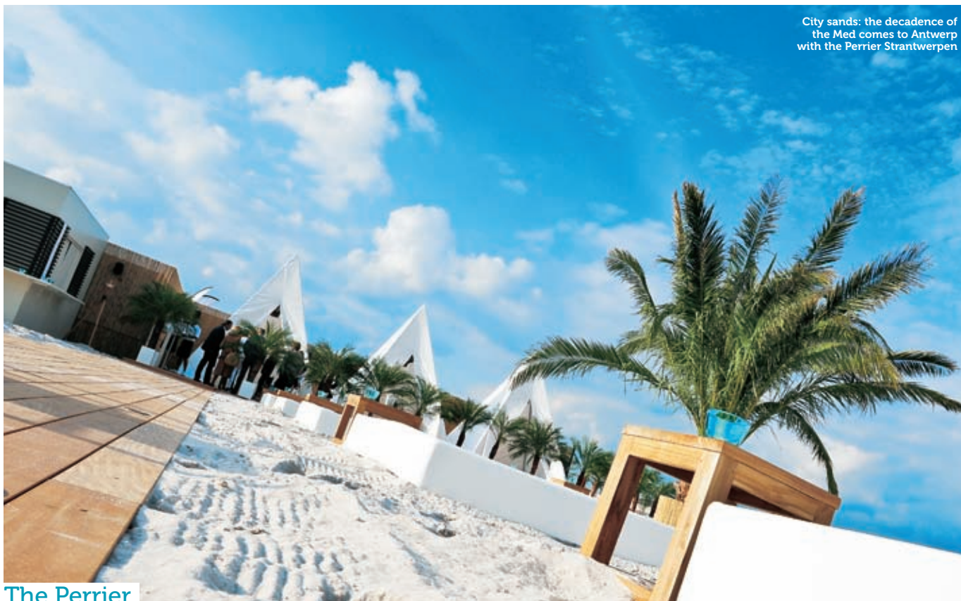
City sands: the decadence of the Med comes to Antwerp with the Perrier Strantwerpen

Luciano Di Gregorio checks out the sizzling supper clubs where Europe's bright young things will be wining, dining and dancing this summer