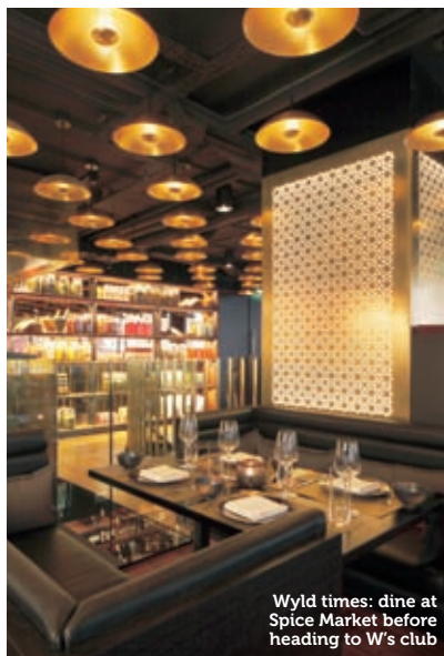
Wyld times: dine at Spice Market before heading to W's club

Clearly inspired by the sand, surf and beach culture of the Belgian Riviera (yes such a thing does exist), a bunch of Antwerp locals have created the perfect summertime hangout: a man-made beach club in an otherwise ancient urban conglomeration. But this is not to be confused with the try-hard efforts of Paris or Berlin. From April through to the end of summer, the Perrier Strantwerpen draws the sand-searching crowds from as far away as Brussels. And it's no wonder: this funky haunt offers a food menu to match the best restaurants in the country and a night-time atmosphere redolent of the French and Italian coastlines that are – though you wouldn't think it – a thousand miles away. Look out for our report on the Flemish resort of Knokke next month.